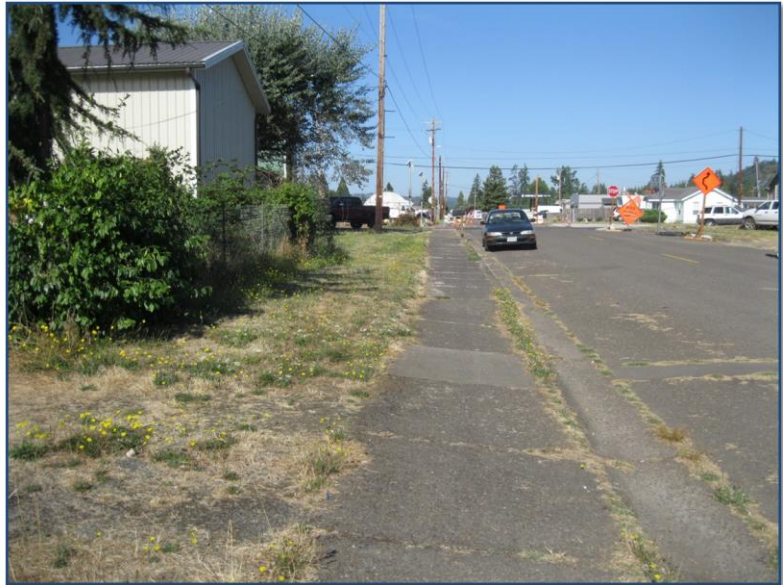
South side of E. Main Street (looking west)