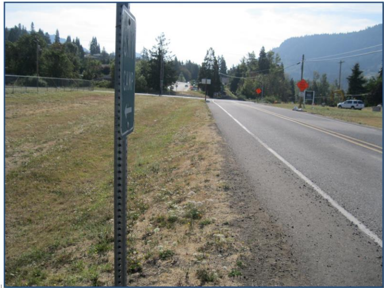
W. Boundary at Pioneer St. (looking east)