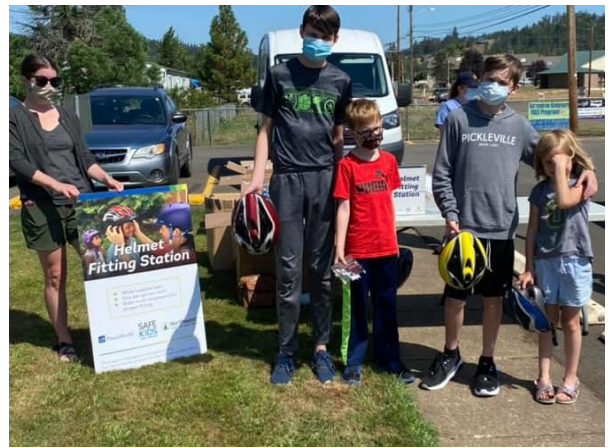
Helmet Donation and Fitting in Lowell (2020)