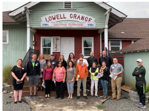
Lowell Downtown Tour (2018)

Project support was garnered through the grant application process. The application was signed by the City of Lowell Administrator and the Lowell School District Superintendent. Letters of support were provided by the Lundy Elementary School Principal, the Lane Area Commission on Transportation; and the Safe Lane Transportation Coalition. Lane County staff worked closely, for several years, with the City of Lowell to develop the grant application. The partnership